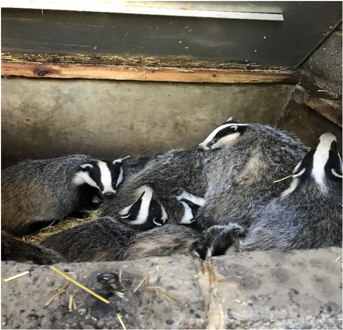
The badgers in the bunker

We used a release site that we have done in the past and we know that it worked well previously and has a very sympathetic and enthusiastic landowner. As well as taking the badgers loaded in their boxes a good supply of straw and food to keep them going until the pen comes down in a few weeks' time and allows them to come and go as they please.